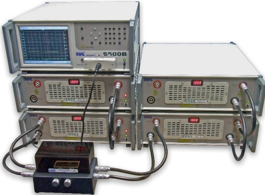
Typical 120 MHz 40 A DC Bias Current System (using 65120B, 4 x 6565-120 and 1027 Fixture)